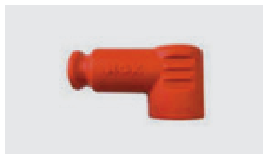
spark plug cap 866707